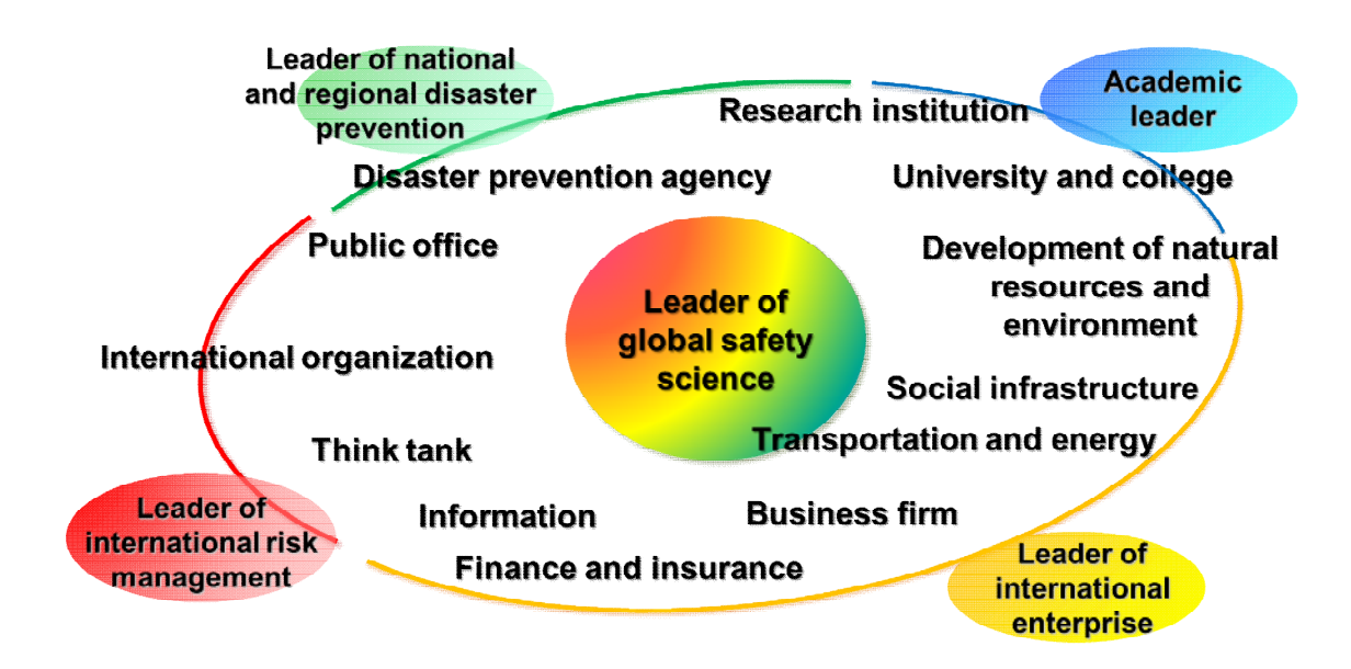
Figure 2: Career paths after graduation

• <u>Global risk management leaders</u>: Leaders able to carry out crisis management for diverse risks from global perspectives, at international and other organizations