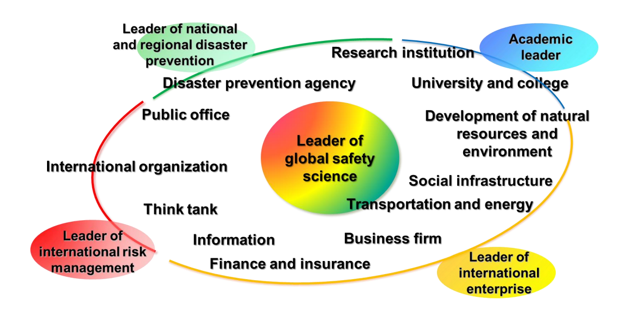
Figure 2: Career paths after graduation

• <u>Global risk management leaders</u>: Leaders able to carry out crisis management for diverse risks from global perspectives, at international and other organizations