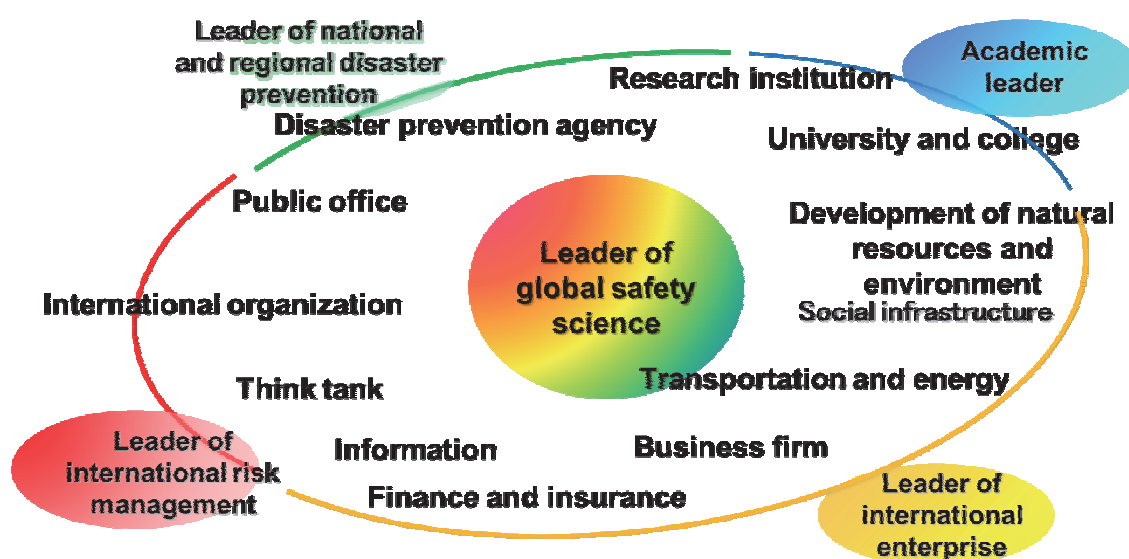
Fig. 2 Expected career paths following program completion