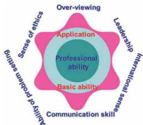
Fig.1 “Hexagonal(Confeito) type” Human Resources