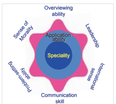
Cultivation of "hexagonal" human resources with diverse capabilities of expertise, development capability in various fields and functions necessary